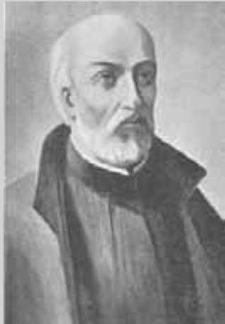
St. John de Brebeuf