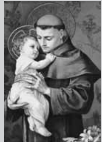
St. Anthony of Padua

Masses: Saturday 5:00 p.m. Sunday 8:30 a.m.